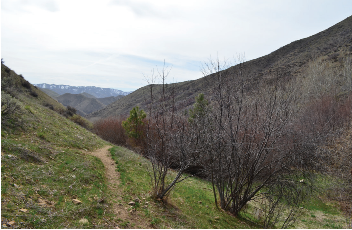
Macks Creek Drainage

meadow. Pooches will have a great time sniffing all the wildlife tracks throughout the meadow.