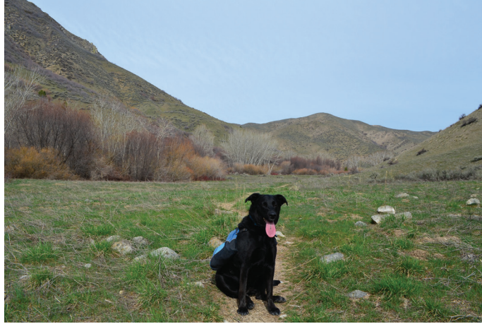
Berry in her office

Macks Creek Park offers reservation-only camping if you’re inclined toward a multi-day excursion around the reservoirs. See Cinch Creek Trail 32 and Cottonwood Creek Trail 33 for other outings nearby.