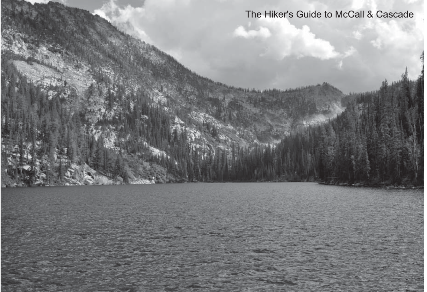
The eastern side of Blackmare Lake is bordered by steep granite ridges.