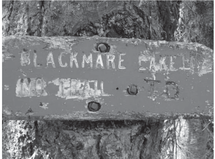
Weathered sign for route to Blackmare Lake.

If you are comfortable with route-finding, continue on to Blackmare Lake. A small footpath travels around the northern shore of the unnamed lake and then